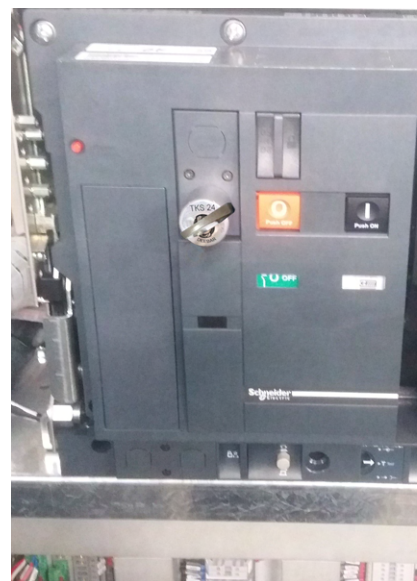
LOCK ON SCHEIDER BREAKER