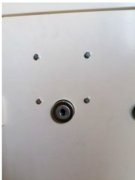
SS1 OUTSIDE PANEL